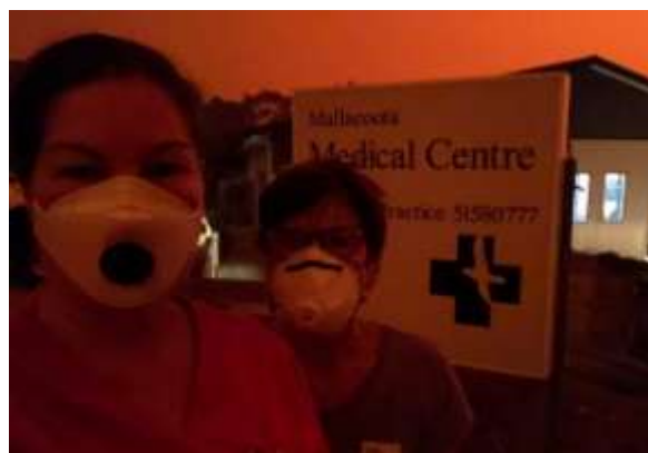
Photo: Doctors take a photo break in daytime, outside Malacoota Medical Centre, Victoria, Australia (with permission)

Family doctors are frequently among the first responders to environmental disasters and emergencies. Even more challenging, though, is that it is family doctors who are the clinical professionals left to manage the aftermath of such disasters and emergencies. The 'first in, last out' phrase holds true in this case. The physical and mental health repercussions of environmental disasters live on in communities for many years, affecting successive generations. Successive generations of family doctors continue to provide care and treatment.